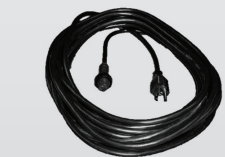
Quick Disconnect Cord