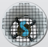
Screen Kits (aka: Turtle Guard)